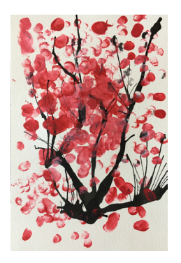
AFTER SCHOOL ART PROGRAM