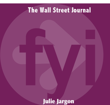
February 11, 2020

Mind Those Manners: Kids Need Lessons in Email and Phone Etiquette